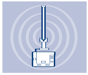
AP-4900 with Omnidirectional antenna